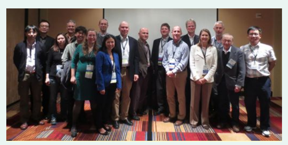
2012 Special Interest Study Group SISG on PPBL at AACAP